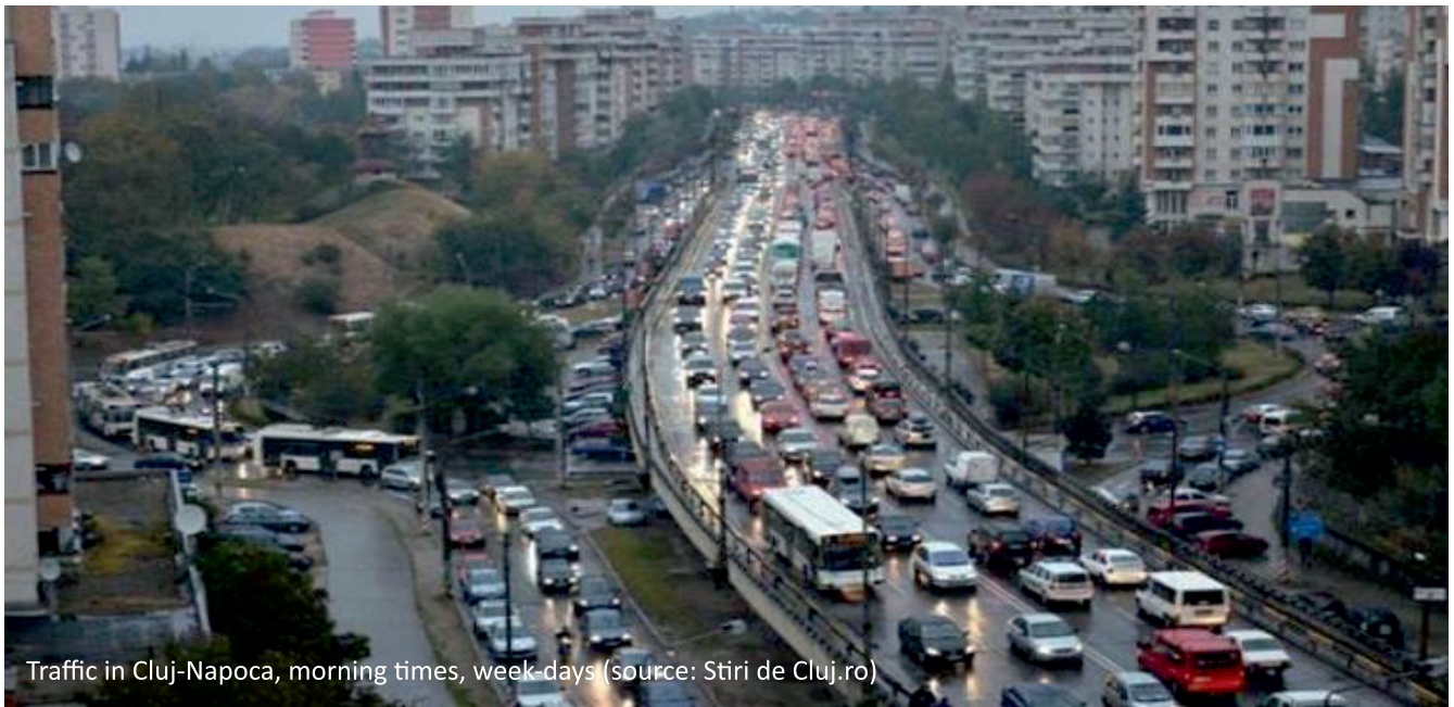
Traffic in Cluj-Napoca, morning times, week-days